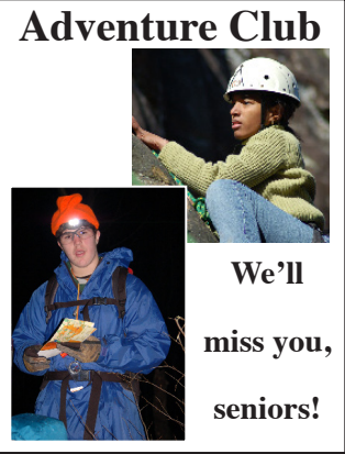
Half page ad