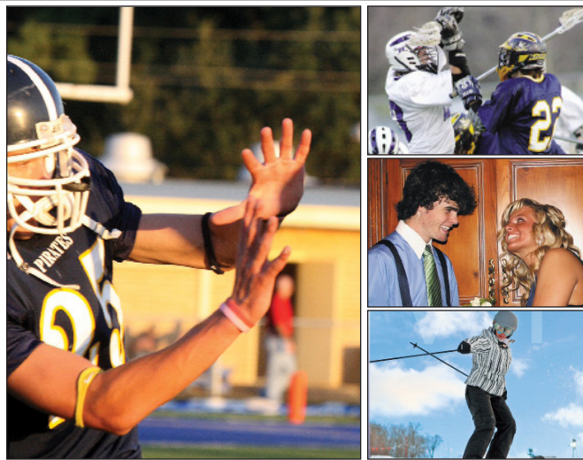
Full page ad